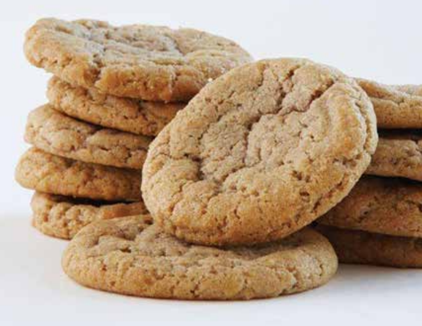
405 SNICKERDOODLE 2 LB. TUB