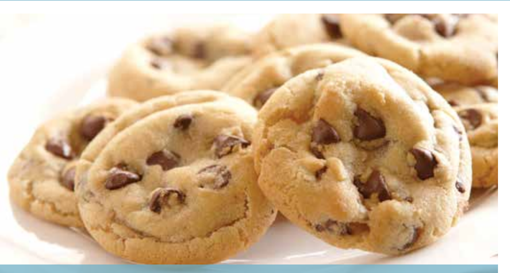
CHOCOLATE CHUNK 400 2 LB. TUB 404 PRE PORTIONED