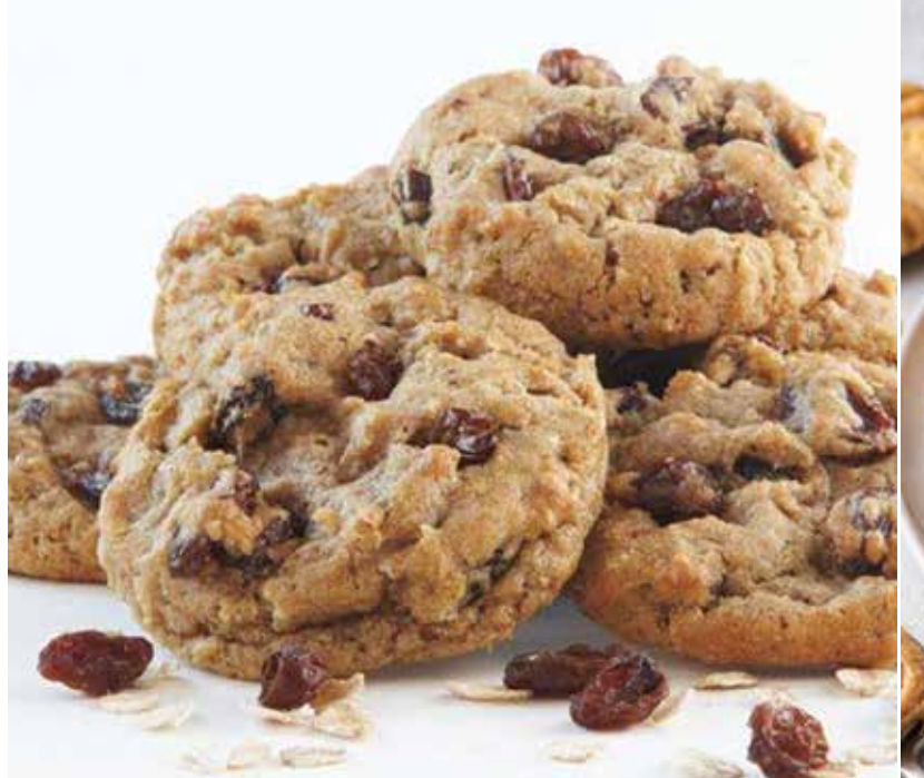
406 OATMEAL RAISIN 2 LB. TUB

Cookie dough may be frozen for up to 1 year or refrigerated for up to 3 months. Our dough is shelf stable at room temperature of 72 degrees or below for 21 days. Cookie dough may be thawed and refrozen.