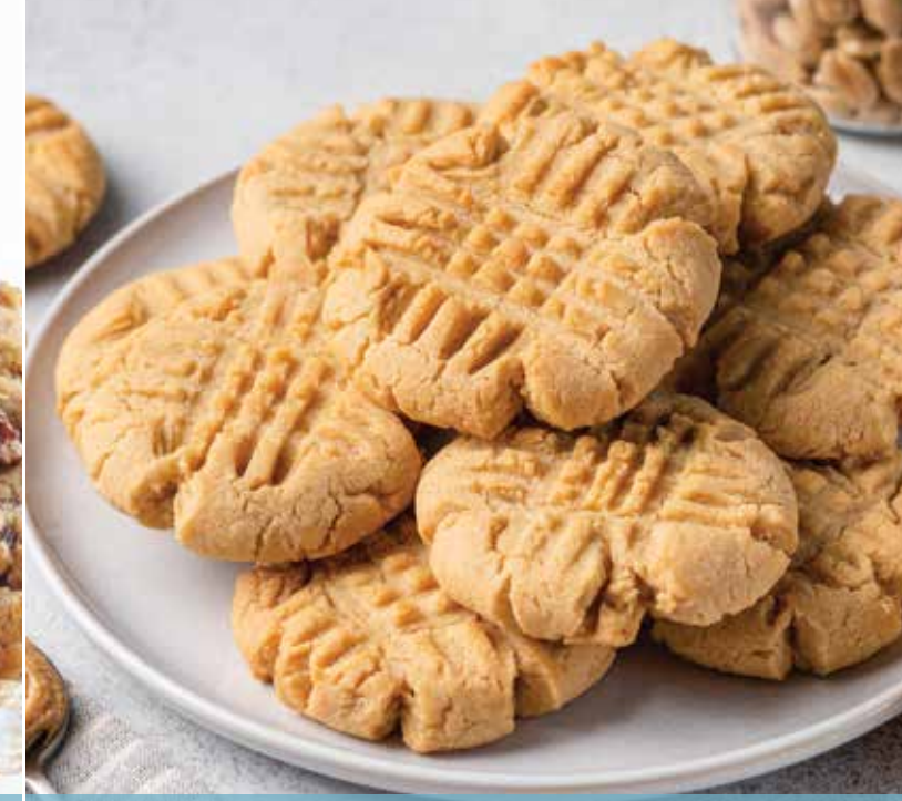
402 PEANUT BUTTER 2 LB. TUB