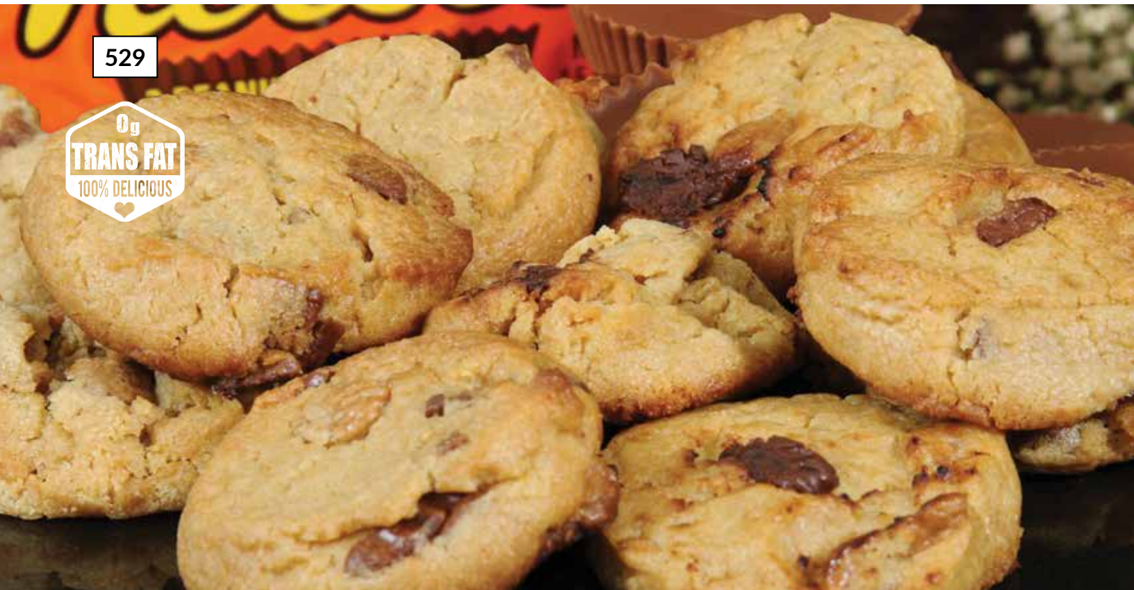
529 REESE'S® PEANUT BUTTER CUP COOKIE DOUGH $20.00 2.5 lbs. (makes approx. 36 cookies). Contains peanuts. 🌿