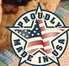
530 OATMEAL RAISIN COOKIE DOUGH $20.00 2.5 lbs. (makes approx. 36 cookies) 🌿