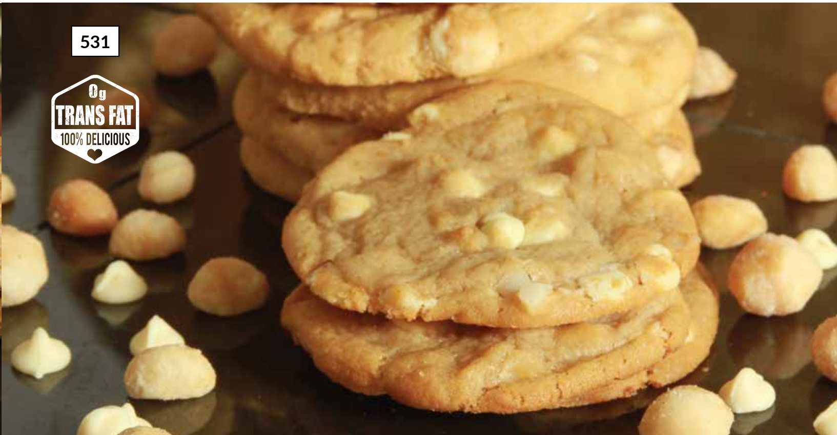
531 MACADAMIA WHITE CHOCOLATE CHIP COOKIE DOUGH $20.00 2.5 lbs. (makes approx. 36 cookies) 🌿